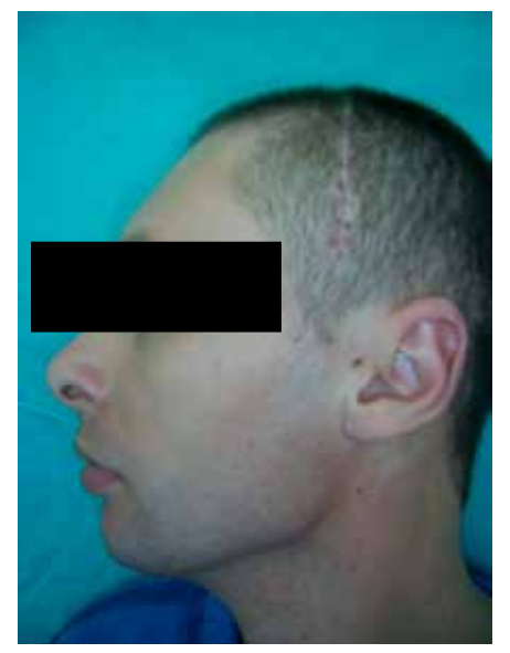
FIGURE 6. Results after a few weeks.

frontal sinus antrum where carefuly overfilled with cancellous bone graft, the saved fragments of anterior plate returned back (without osteosynthessis), and protected with periost and perioranium (Figure 4). The wound is closed with a single stitches (Figure 5).