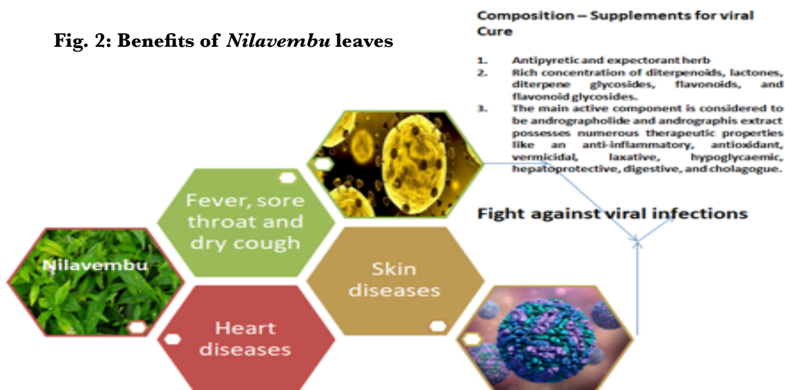
Fig. 2: Benefits of Nilavembu leaves

Ramanathan et al discussed the method of formation of the Nilavembu Kudineer capsule which was prepared from Nilavembu Churnam , ethanol and water solvents extracts, and then the extract was dried. The dried extract powder was screened by various chemical and microbiological tests to ensure the potency. The results confirmed that the extract has active biomolecules and possess their activity.