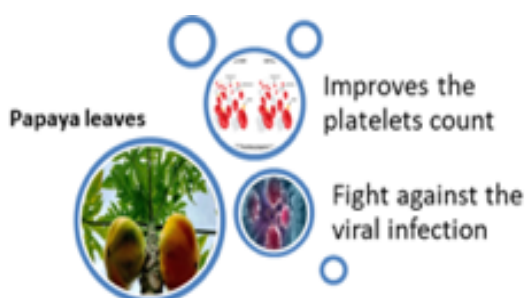
Fig. 3: Benefits of Papaya leaves

one of the best herbs that boost the human immune system and contribute to increase the WBC count in the blood, since it contains phytochemicals, bioflavonoids and anti-oxidants compounds, such as rosmarinic acid, which is a very good anti-microbial agent for treating infections in the respiratory tract. Holy basil is an excellent remedy for cough, soothes the throat, reduces the inflammation of the chest and helps to expectorate the mucus. The major benefits of basil leaves are shown in Figure 4. Normally, Tulsi water will be added with turmeric, Chitharathai ( Alpinia Galangal ), Ginger, and Pepper.