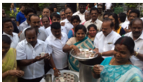
Fig. 1 a & b: Distribution of Nilavembu Kashaya by the Government of Tamil Nadu during 2017 to prevent viral infections

Nilavembu Kashayam (herbal decoction), is a Siddha Medicine recommended for the prevention and management of several types of viral infections/fevers. It acts as an immunostimulant and immunomodulator, which boosts immunity and modulates defence response in the body, which helps to protect from infections and their complications. 10 It contains herbal ingredients, which have antipyretic, anti-inflammatory, antiviral, and immunomodulatory actions. The major benefits of this Nilavembu are projected in Fig. 2.