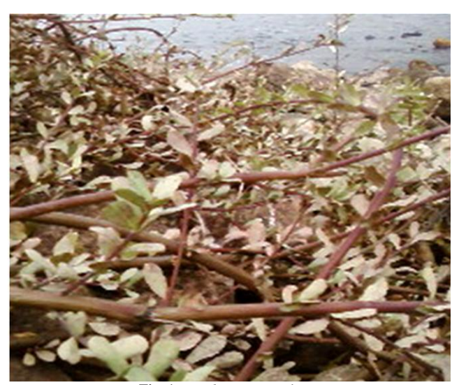
Fig. 1: Rotula aquatica plant.

Roots and leaves of Rotula aquatica (Fig 1) were collected from rocky beds of river Bhadra, 2Km away from Kuvempu University campus, Shivamogga, Karnataka and authenticated in the Department of Biotechnology, Kuvempu University.