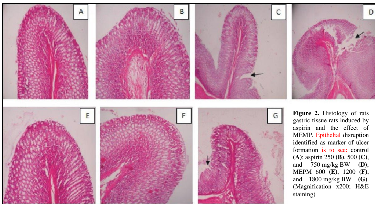
Figure 2. Histology of rats gastric tissue rats induced by aspirin and the effect of MEPM. Epithelial disruption identified as marker of ulcer formation is to see: control (A); aspirin 250 (B), 500 (C), and 750 mg/kg BW (D); MEPM 600 (E), 1200 (F), and 1800 mg/kg BW (G). (Magnification x200; H&E staining)