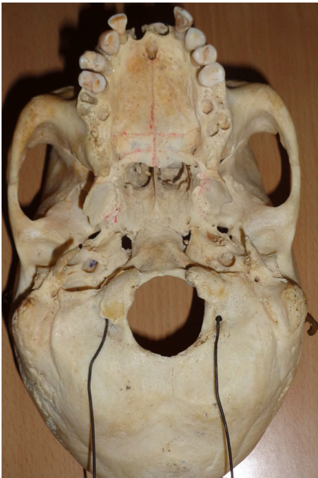
Figure 1: Bilateral posterior condylar foramina (probed).

incidence of 77% unilaterally. [8] Galarza et al. found intrasinus form in 24.6% bilaterally, 17.8% on the right side and 13.5% on the left side, whereas retrosinus form of the posterior condylar foramina in 1.2% bilaterally and 1.2% unilaterally on the right side. [9] Krause discovered that condylar canal was present bilaterally in 21% and unilaterally in 38%. [10] In our study, we observed posterior condylar foramina in 13 skulls of the 50 dry skulls. The incidence of posterior condylar foramina was 26%: bilateral incidence was 16%, whereas unilateral was 10% (Figures 1–3). Intrasinus form of posterior condylar foramina in 20% and retrosinus form in 6% were observed in