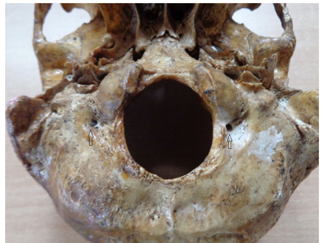
Figure 2: Bilateral posterior condylar foramina.