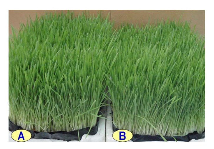
Figure 2. Green fodder biomass produced under irrigation with WW (A) was higher than that irrigated with TW (B).

Results of this study showed that green fodder produced with WW was higher by 40% than that with TW. Similar trend has been noticed for dry matter production (Table 4). Al-Ajmi et al. (2009) found that total barley