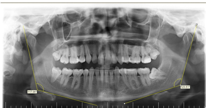
Figure 1. Measurement of the gonial angle in orthopantomogram

The SPSS for Windows statistical package version 23.0 (SPSS Inc., Chicago, IL) was used for all descriptive statistics and analyses. The level of significance was set to P < .05 . Since the data were normally distributed, multiple comparison tests (ANOVA) and Tukey tests were used to determine differences among and between the three groups. Independent t-test was performed for comparison of orthopantomogram and cephalometric measurements. Mean values and standard deviations were calculated for all the parameters. Pearson correlation was applied for comparing the correlation of different variables. Statistical power analysis was performed to calculate the number of samples for %96 confidence interval.