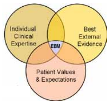
FIGURE 1. Evidence based medicine triad

EBM application means relating individual clinical signs, individual clinical experience with the best scientific evidences obtained by the clinical research (2). The revised and improved definition of evidence-based medicine is a systematic approach to clinical problem solving which allows the integration of the best available research evidence with clinical expertise and patient values. Under the individual clinical noticing we thought of the ability, skill that doctors acquired during years of clinical practice, and clinical experience is necessary and indispensable part that makes a good doctor. The best scientific evidence is considered to be a randomized controlled clinical study conducted on the amount of respondents that can prove the effectiveness of many drugs, as well as the harm and the inefficacy of others in comparison with the best existing therapy (3). The practice of evidencebased medicine is a process of lifelong, self-directed, problem-based learning in which caring for one's own patients creates the need for clinically important informa-