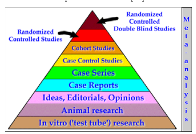
Figure 2. Types of research

cine is the growing number of examples, in which current medical practice cannot cape pace with the