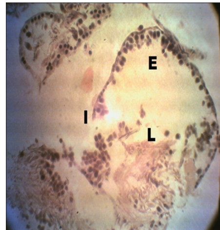
Figure 4: Cross-section of the testis of Group D rats. Treatment: Exposed to 10 ml of imiprothrin for 4 weeks (hematoxylin and eosin \times 400 ), E: Seminiferous epithelium, L: Lumen of seminiferous tubule, I: Testicular interstitium

As shown in Figure 3, the seminiferous tubules of the rats in Group C that were exposed to 5 ml IPA-based air freshener showed moderate degeneration in testicular histoarchitecture. The testicular interstitium was also reduced and was detached from the seminiferous tubules, isolating them from each other. The diameter of the lumen was reduced, characterized by slight vacuolization of the interstitium and reduced spermatozoa.