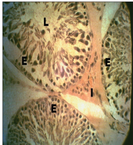
Figure 2: Cross-section of the testis of Group B rats. Treatment: Exposed to 5 ml of imiprothrin for 3 weeks (hematoxylin and eosin \times 400 ), E: Seminiferous epithelium, L: Lumen of seminiferous tubule, I: Testicular interstitium