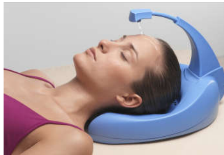
Figure-3 Jala-Shirodhara in operation