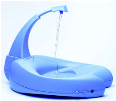
Figure -1 Crisalmind Jala-Shirodhara Machine