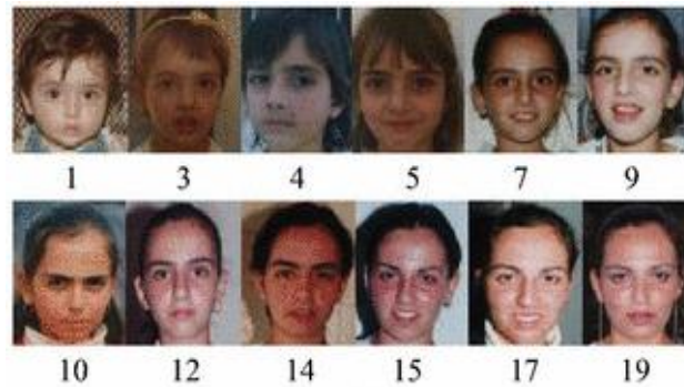
Figure 1. Sample face images from FGNET. The number below each facial image represents the age in years.

MORPH: The MORPH database includes 55,134 face images from 13,618 different people. The age range of this database is from 16 to 77 years. The average number of existing face images for each person is approximately 4. The age gap in this database is 0-5 years. Some samples of the face images from this database are shown in Figure 2. In this figure, the age of the person for whom the face image has been captured is mentioned below the image.