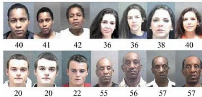
Figure 2. Sample face images from MORPH. The number below each facial image represents the age in years.

MORPH: The MORPH database includes 55,134 face images from 13,618 different people. The age range of this database is from 16 to 77 years. The average number of existing face images for each person is approximately 4. The age gap in this database is 0-5 years. Some samples of the face images from this database are shown in Figure 2. In this figure, the age of the person for whom the face image has been captured is mentioned below the image.