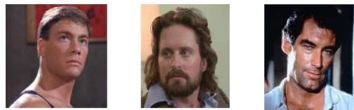
Figure 4. Sample face images from AgeDB.

AgeDB: This database contains 16,488 images from 568 different people captured in real-world conditions. Hence, the images of this database may include different poses and expression, noise, occlusions and any uncontrolled conditions. Hence, this database would be used for training and testing the deep neural networks. Also, the age range of this database is from 1 to 101 years. The average number of existing face images and the average age range for each person are 29 and 50.3 years, respectively. Figure 4 shows some sample images from this database.